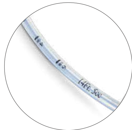
Centimetre marks to measure the abdominal wall.