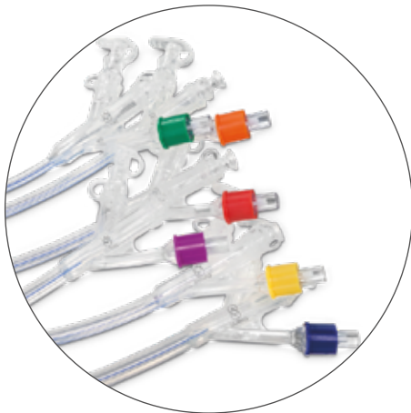
Wide range of sizes available.