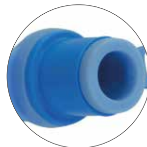
Universal 15 mm connector (can be fitted to ventilator).