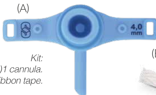
Kit: (A) 1 cannula. (B) 1 Fixation ribbon tape.