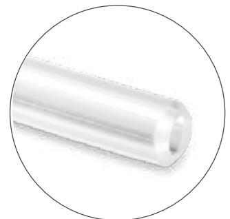
Open, rounded end.